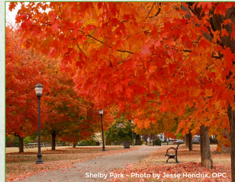
Shelby Park