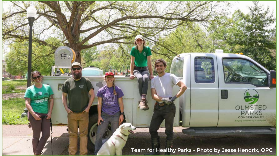
Team for Healthy Parks