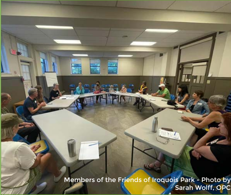
Members of the Friends of Iroquois Park