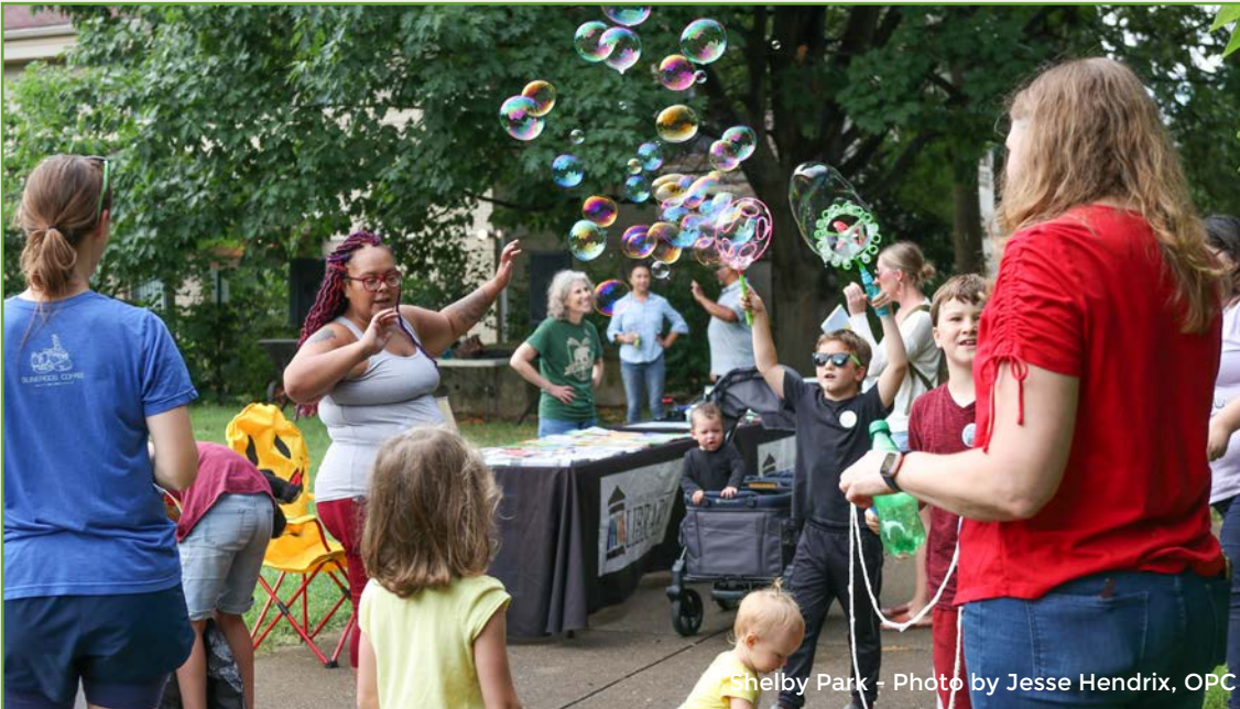
Shelby Park