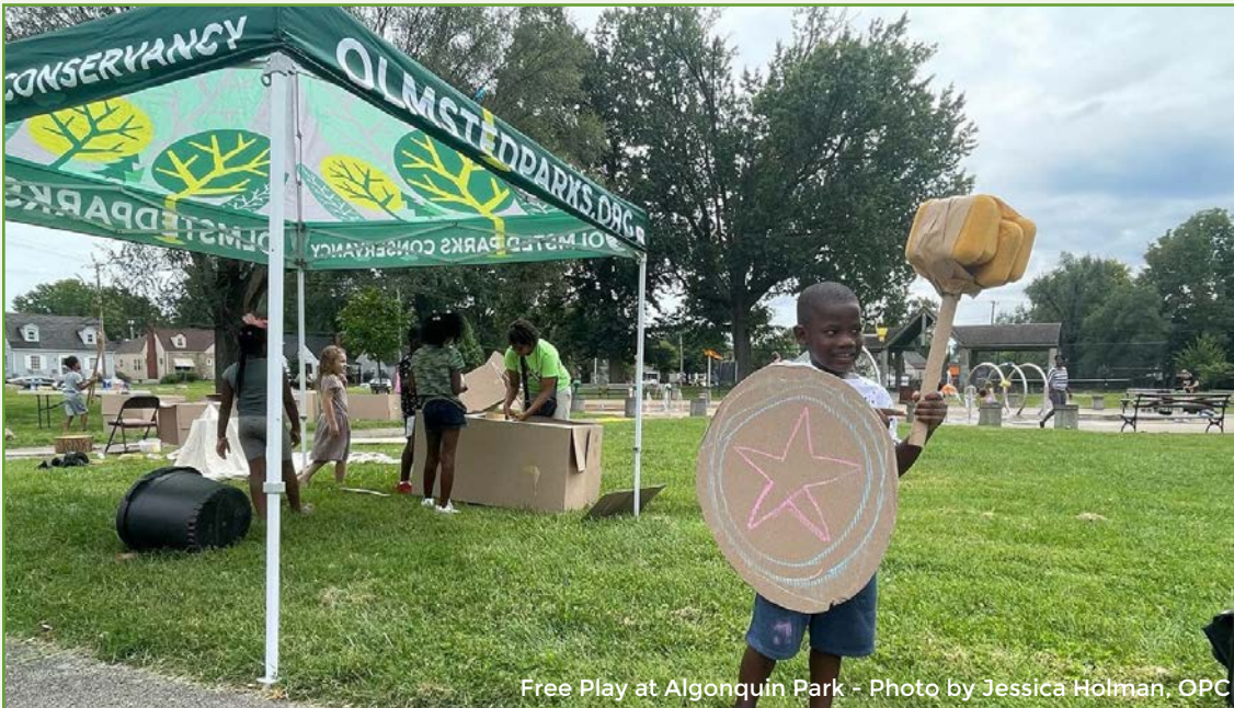
Free Play at Algonquin Park