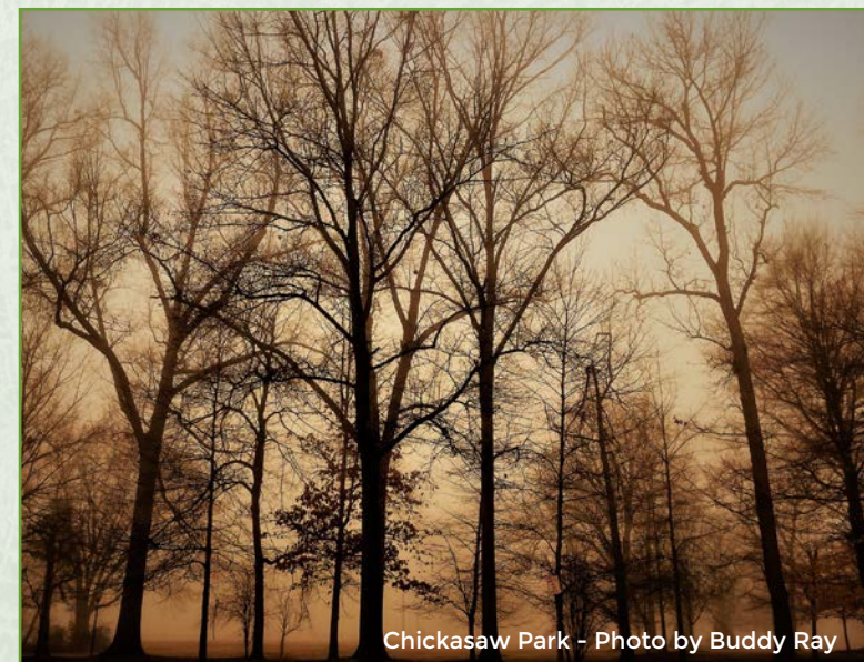
Chickasaw Park