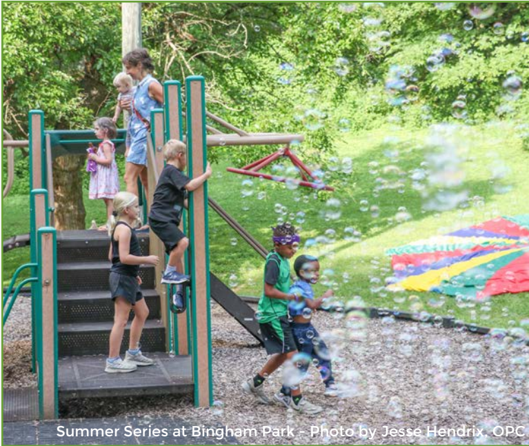
Summer Series at Bingham Park