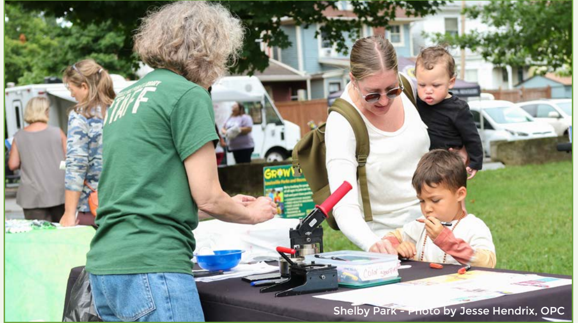
Shelby Park