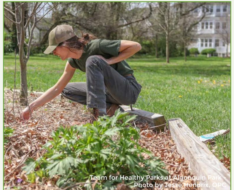
Team for Healthy Parks at Algonquin Park