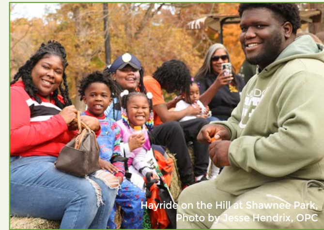
Hayride on the Hill at Shawnee Park