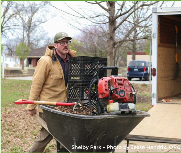
Shelby Park