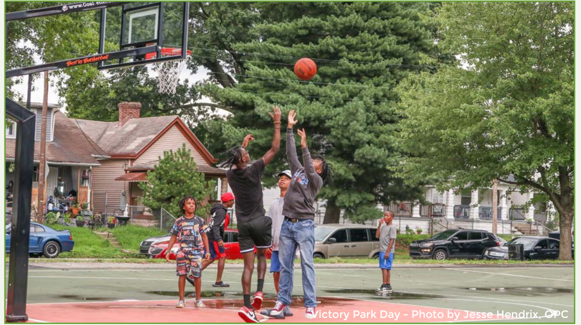
Victory Park Day