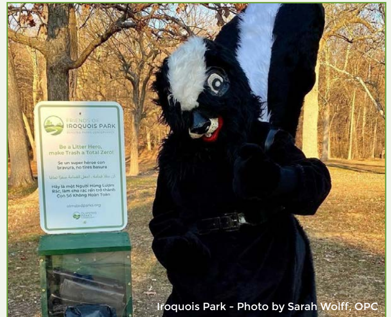
Iroquois Park