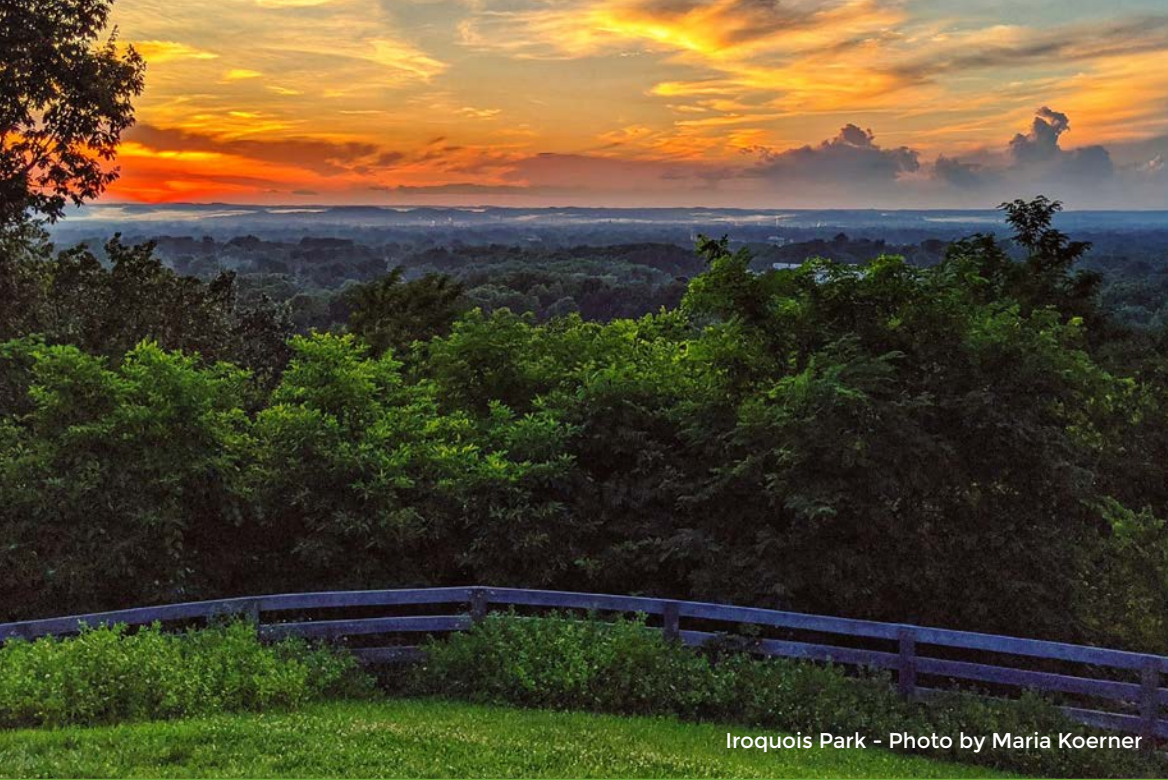
Iroquois Park