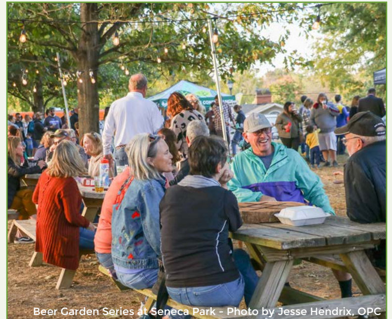
Beer Garden Series at Seneca Park