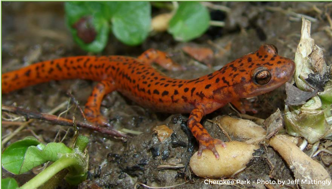
Cherokee Park