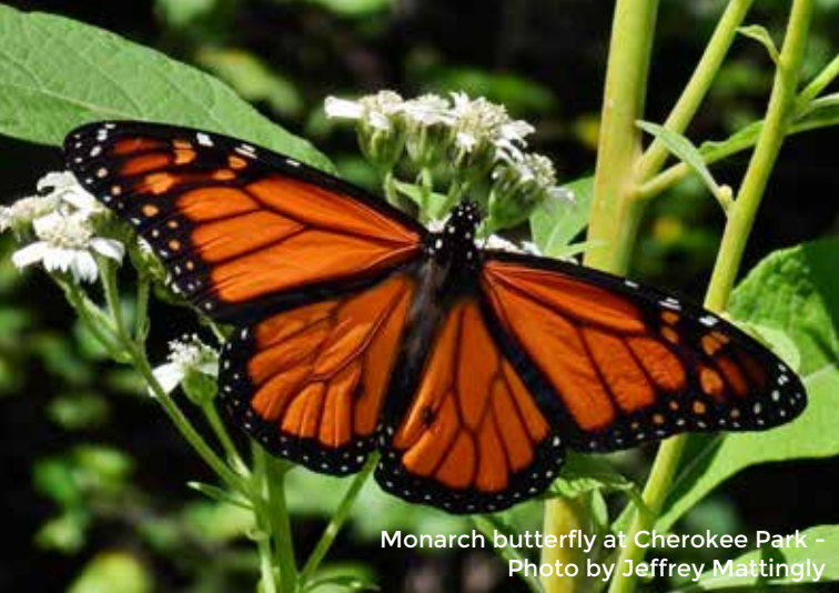
Monarch butterfly at Cherokee Park

“The parks are so thoughtfully designed. The parkways connect the parks together, and the city as well. This was a visionary project that changed the outcome of Louisville. People have a sense of pride in their neighborhood parks, but what we want to emphasize is the importance of investing in the whole Olmsted Parks system. It promotes connection and unity in our city.”