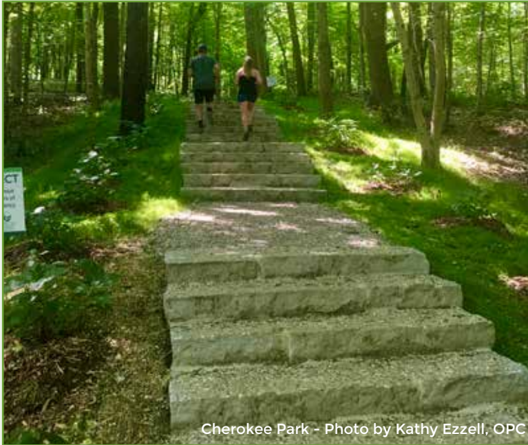
Cherokee Park - Photo by Kathy Ezzell, OPC