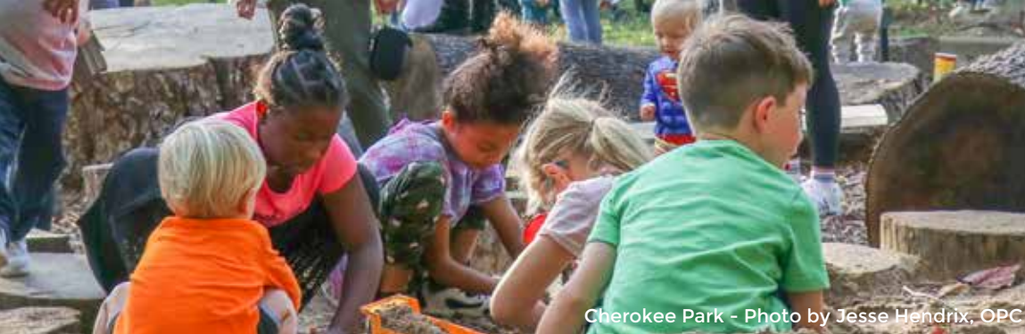
Cherokee Park