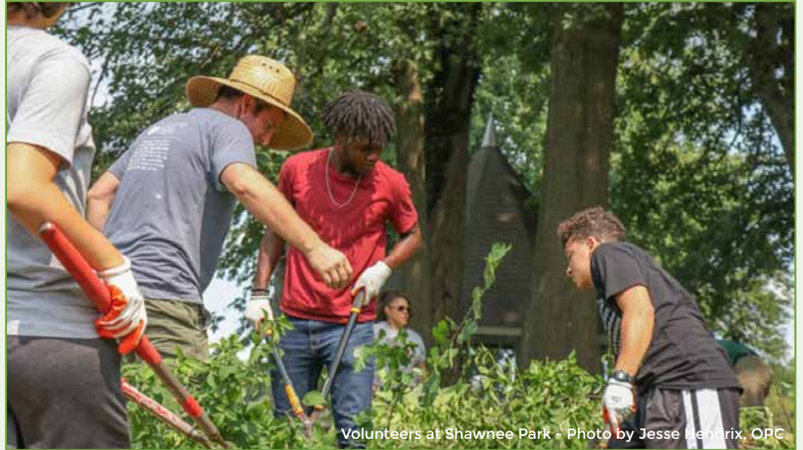
Volunteers at Shawnee Park