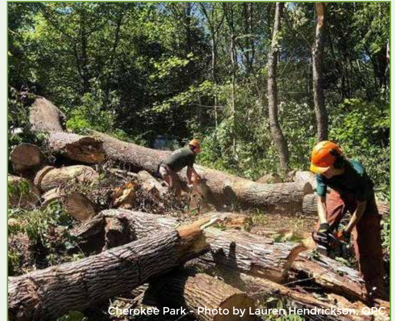
Cherokee Park