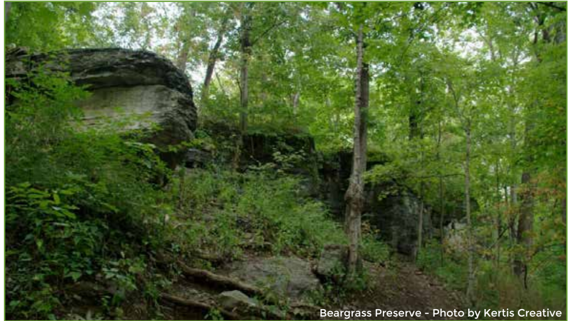
Beargrass Preserve