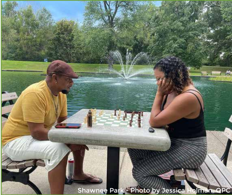
Shawnee Park