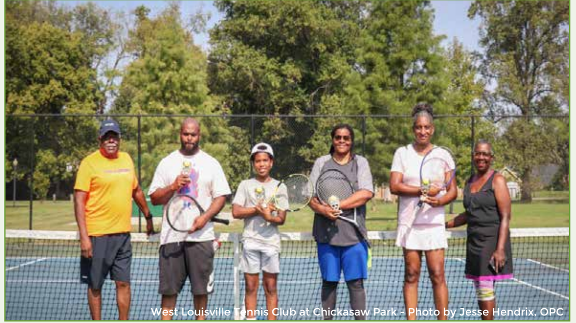
West Louisville Tennis Club at Chickasaw Park