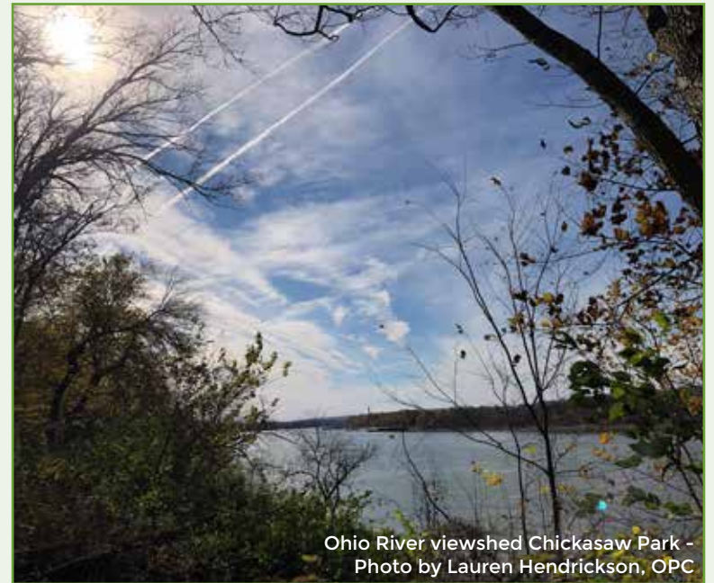
Ohio River viewshed Chickasaw Park