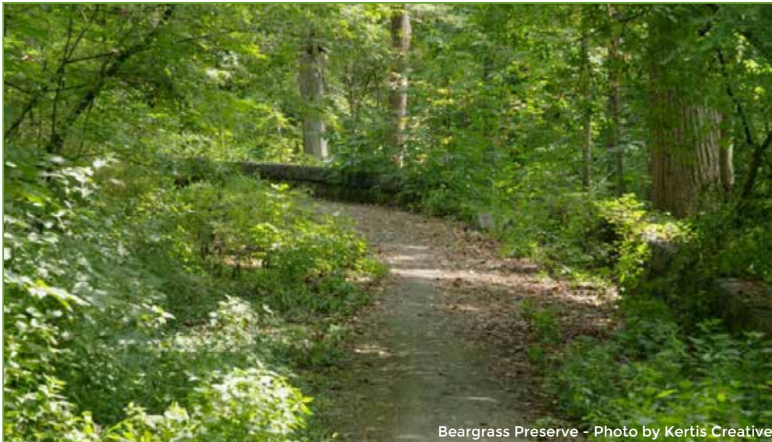
Beargrass Preserve