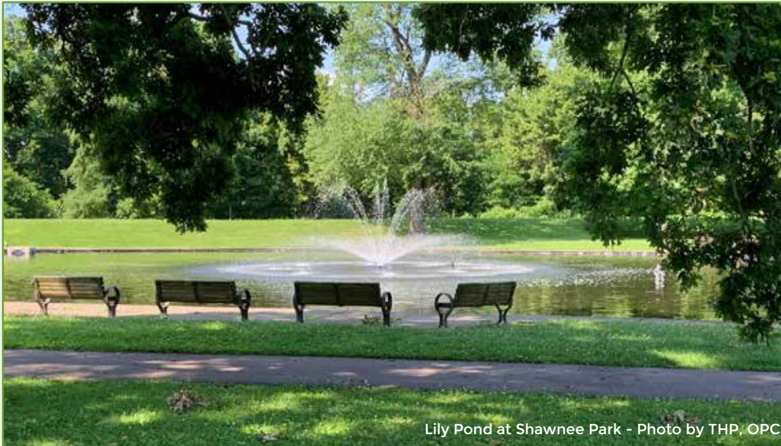
Lily Pond at Shawnee Park