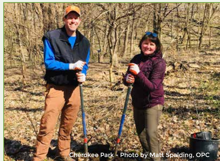
Cherokee Park