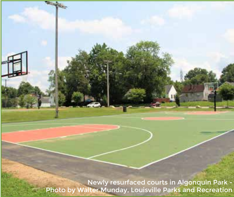
Newly resurfaced courts in Algonquin Park