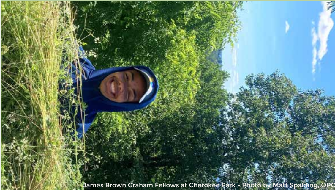
James Brown Graham Fellows at Cherokee Park