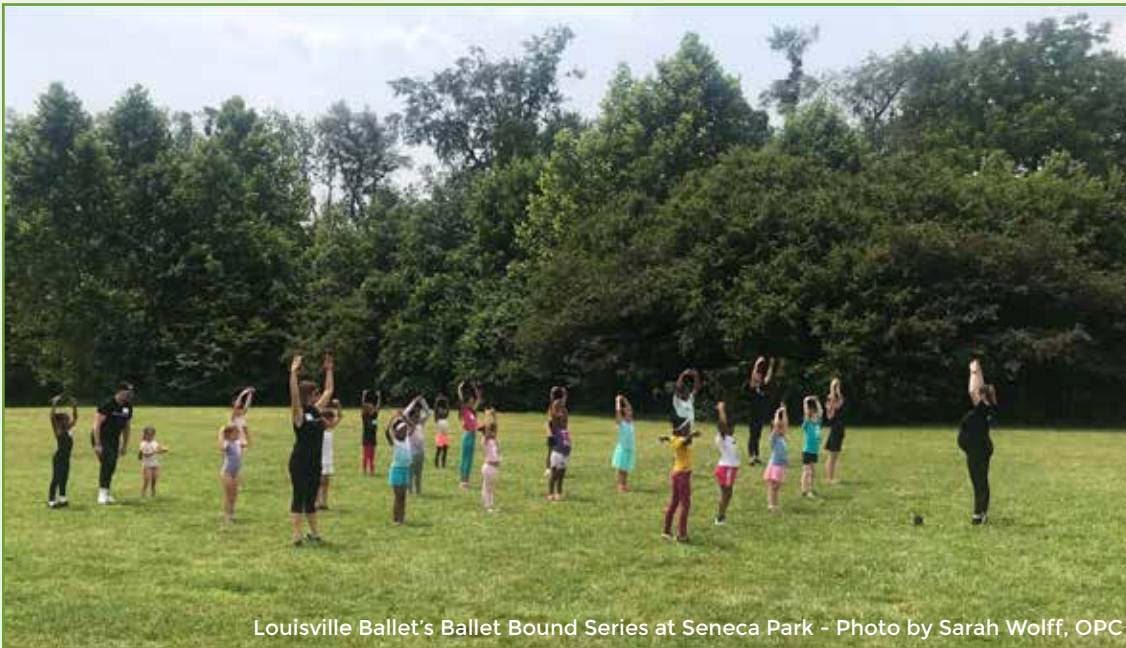
Louisville Ballet's Ballet Bound Series at Seneca Park