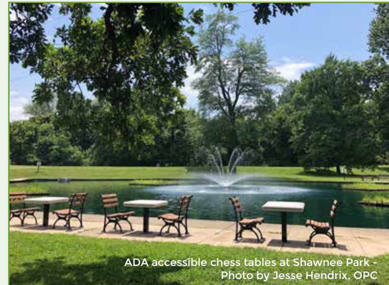
ADA accessible chess tables at Shawnee Park