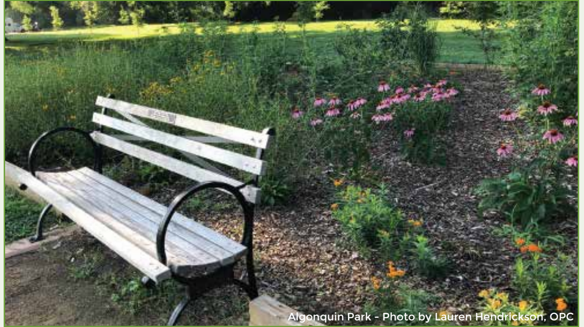
Algonquin Park