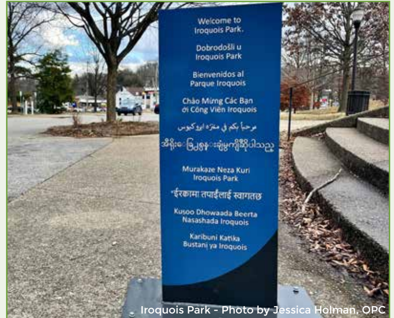
Iroquois Park